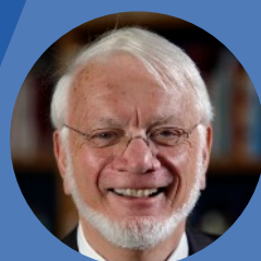
Thomas Steitz Nobel Laureate in Chemistry, 2009 Yale University

Celebrating the Auspicious Occasion of the 60 th Birthday Anniversary of H.R.H. Princess Chulabhorn